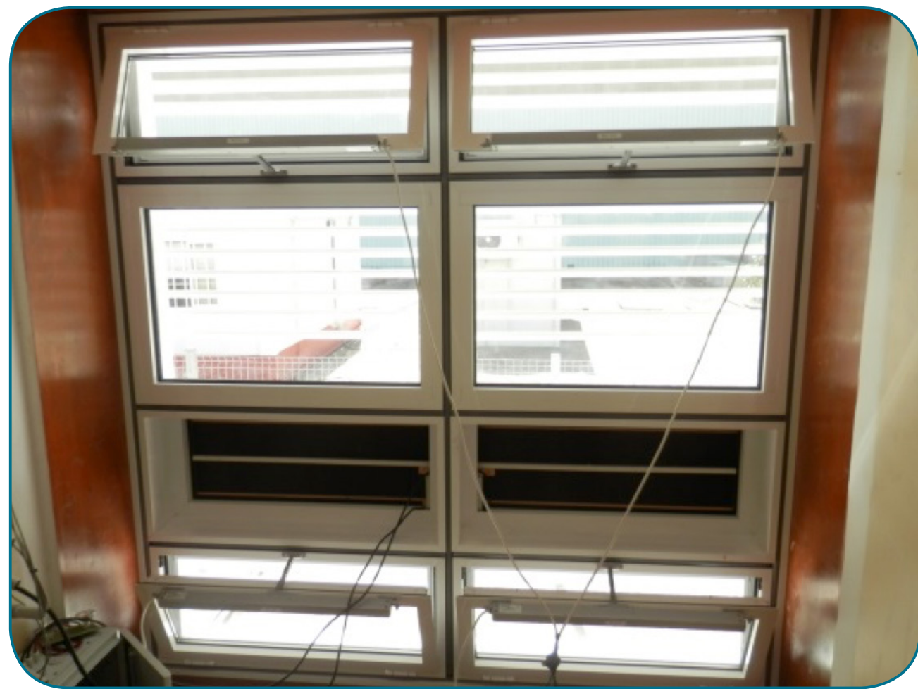
Façade prototype system with the motors installed and connected under monitoring